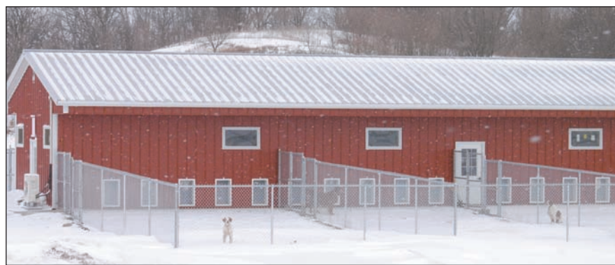
Affordable Pet Services now has a new pet boarding facility with expanded kennel space and several outdoor exercise areas.

"The time of day I look forward to the most is the evenings when I am able to spend one-on-one time with each pet," she said. "It's like a mini vacation every night of the week. The rest of the world melts away and it's just me and the ani-